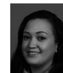
Barenese Du-Pont Fieldwork International